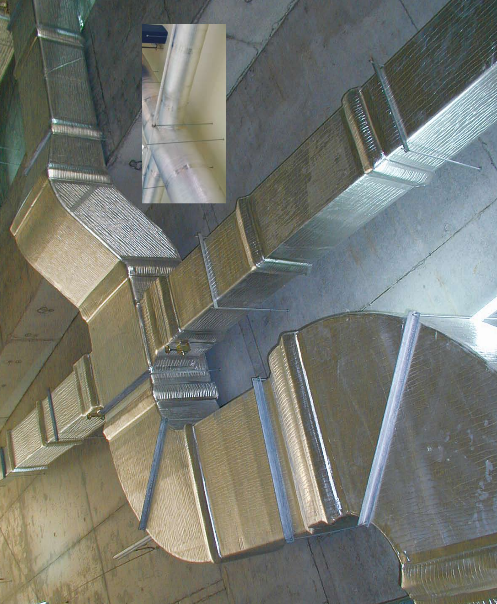
Governor Phillip Tower, Sydney